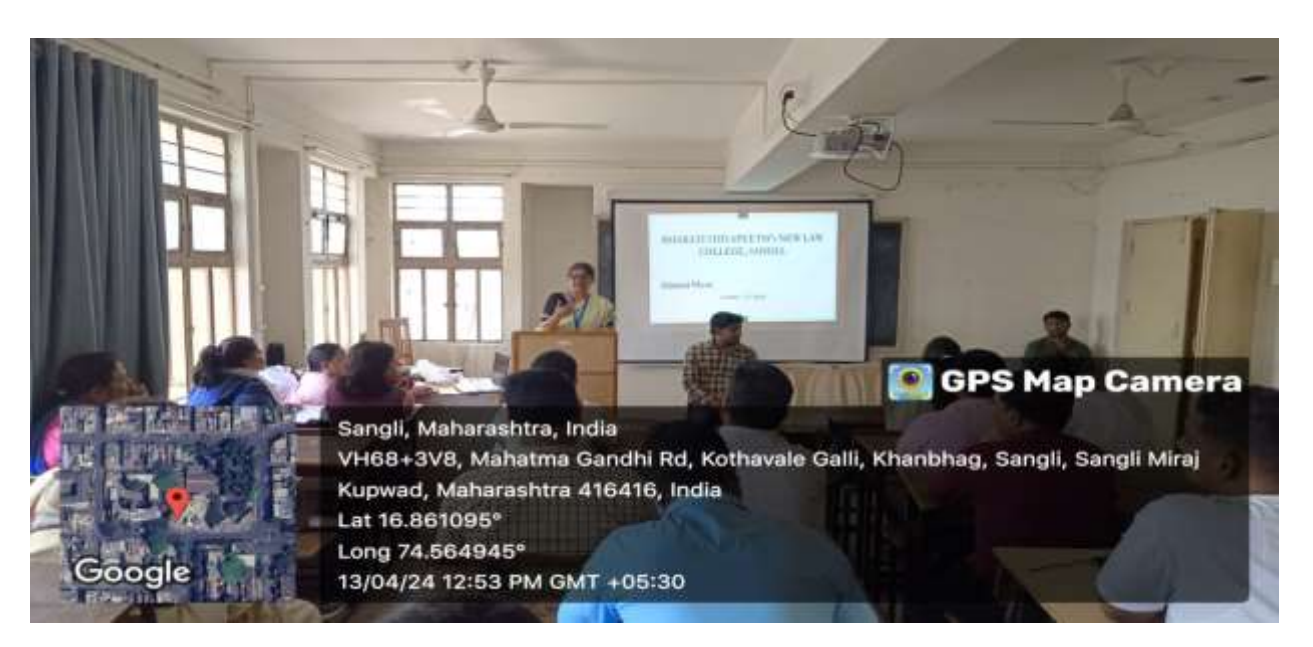
Principal Dr.Pooja Nawadkar guiding the alumni

Alumni were satisfied to see progress of the college. They showed a positive response for guiding the students for various academic activities and about various future plans. They are willing to help students in Moot court and Mock trial activities and guiding the students in per cuing higher studies and placement related activities.