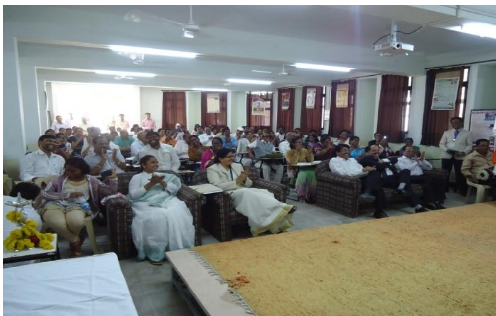
Participants, Judicial Staff, and Para-Legal Volunteers