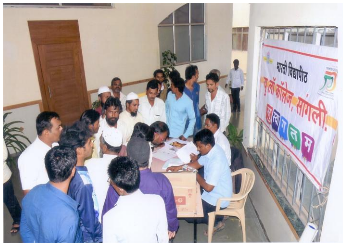
Registration Counter for Rickshaw drivers.