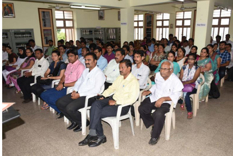
August presence of BV's New Law College, Alumni's