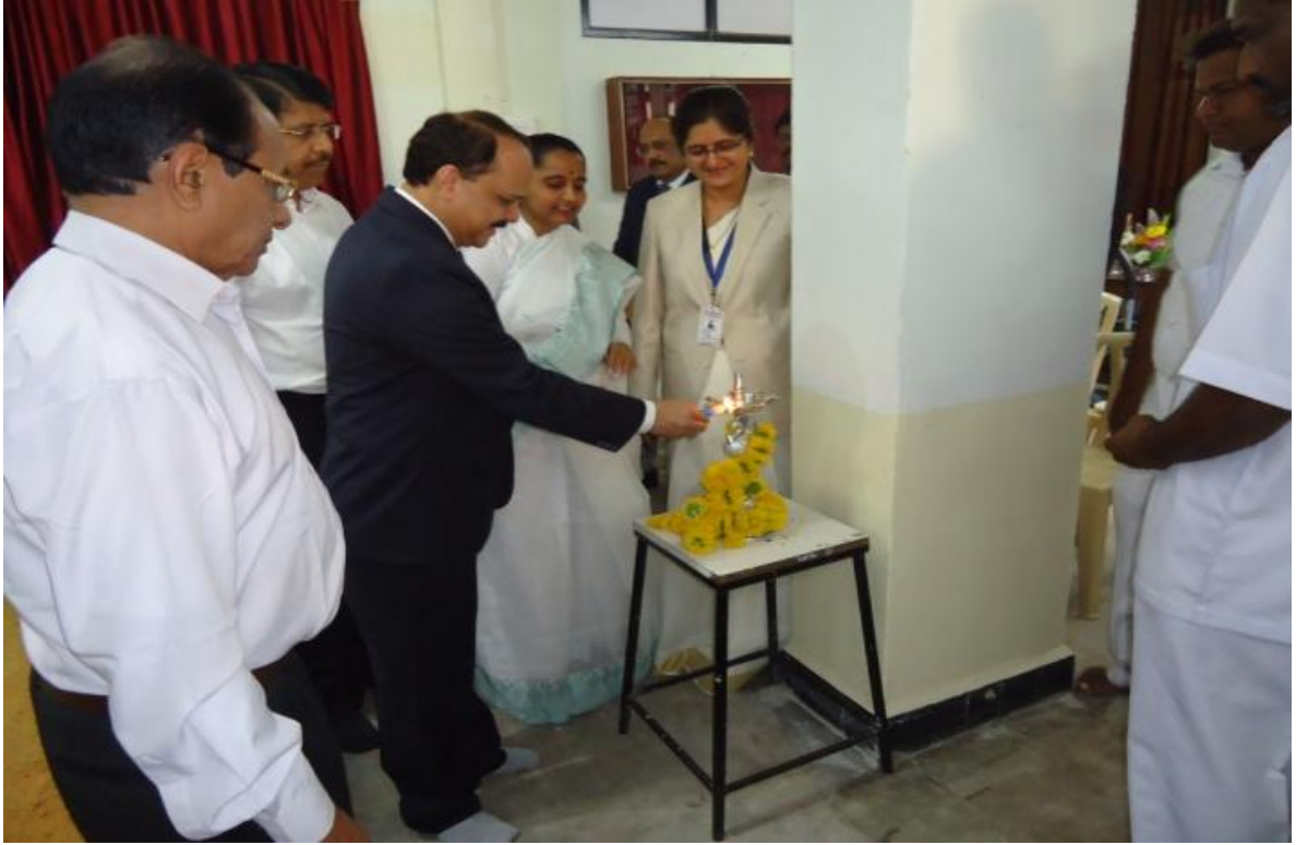
Hon. S.P. Tawade, Principal District and Session Judge, Sangli Inaugurating the Function