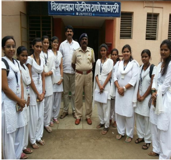
Students Visit at Miraj Gramin Police Station, Miraj , Visit at Vishrambhag Police Station, Sangli