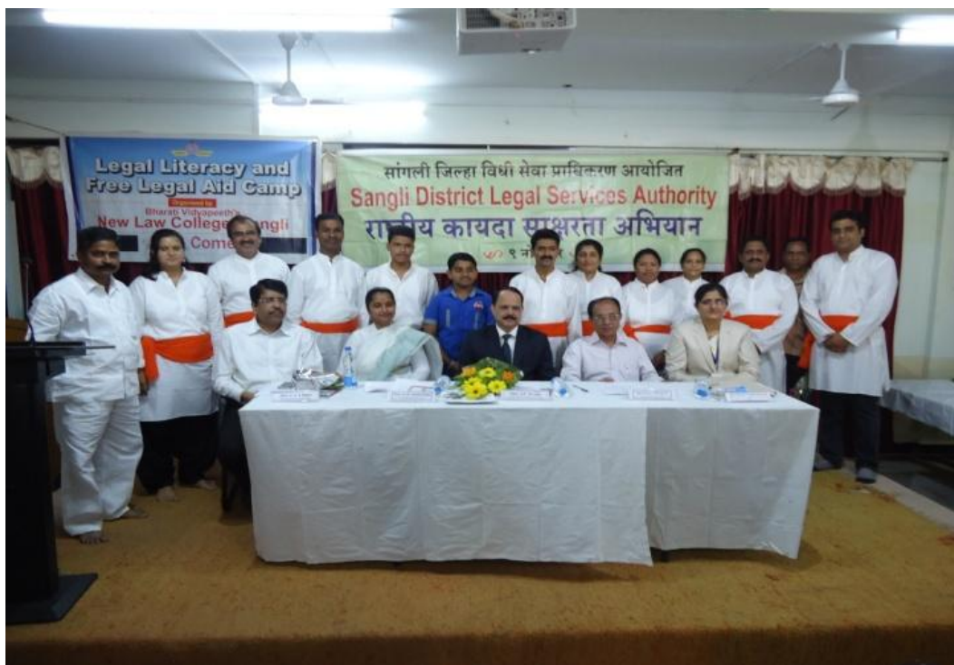
Members of Street Play with distinguished Guest