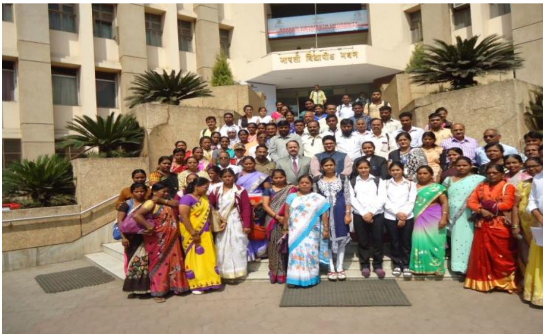
Participants, Judicial Staff, and Para-Legal Volunteers with guest