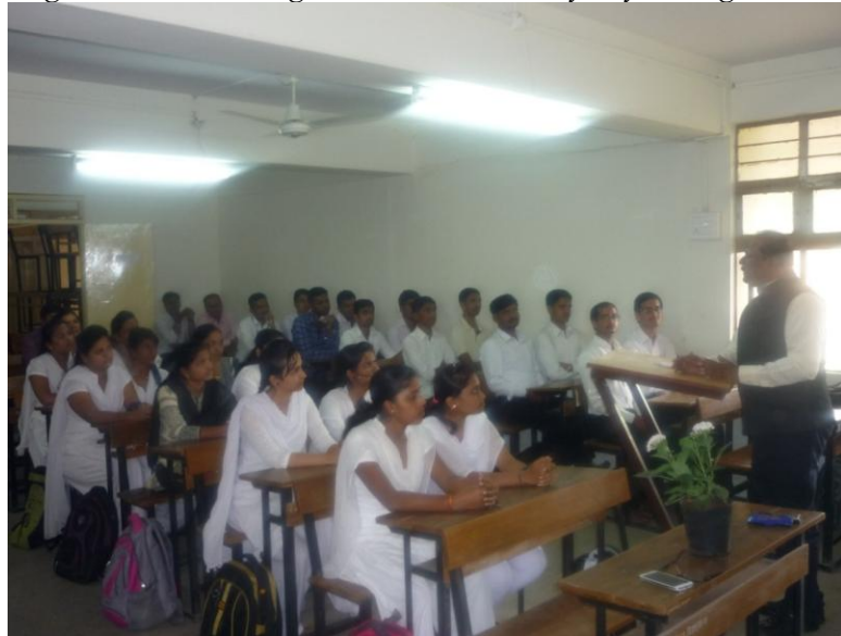
Students Participation at the Inauguration of NSS Program