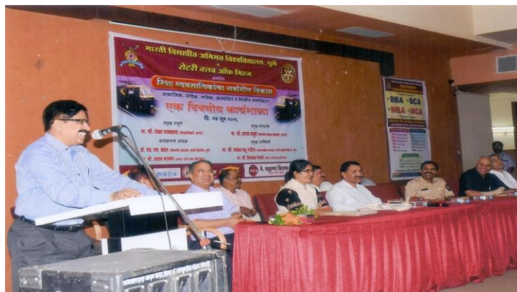
Hon'ble Shekhar Gaikwad, District Collector, Sangli