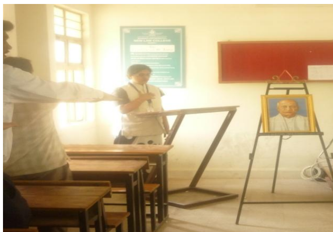
National Unity Pledge on the occasion of Sardar Vallabhbhai Patel Jayanti