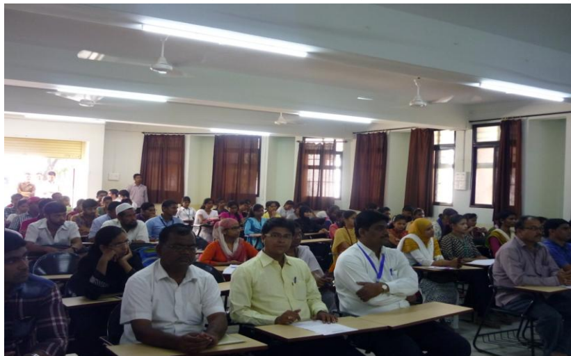
Teaching Staff and Student Participants