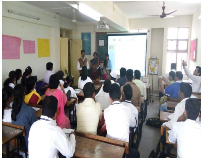
Question and Answer Session