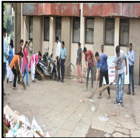
Teaching, Non-Teaching at Swach Bharat Abhiyan