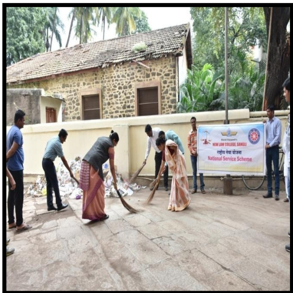
Students at Swach Bharat Abhiyan