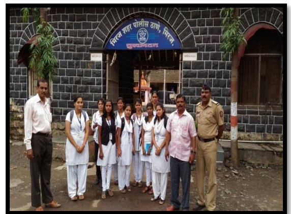
Visit at Miraj CityPolice Station, Miraj