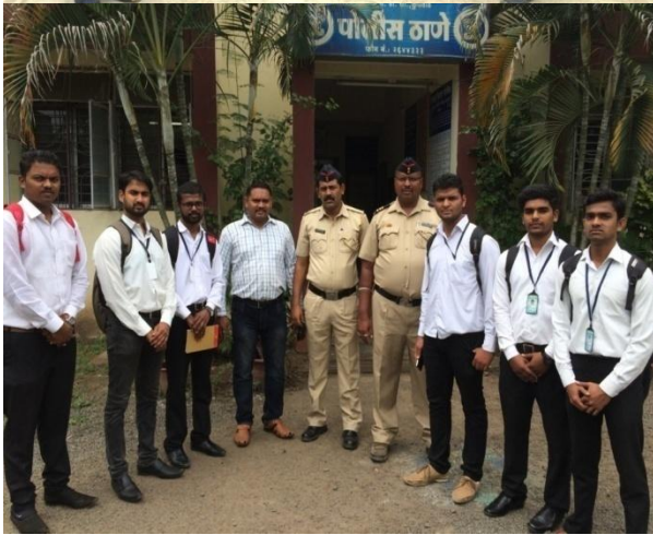
Visit at Miraj Railway Police Station, Miraj