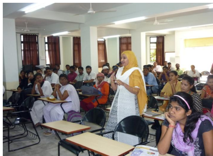
Question- Answer Session