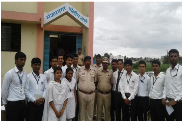
Students Visit at SanjaynagarPolice Station, Sangli