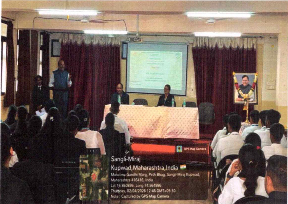
Sangli-Miraj Kupwad, Maharashtra, India Mahatma Gandhi Marg, Peth Bhag, Sangli-Miraj Kupwad, Maharashtra 416416, India Lat 16.860895, Long 74.564986 Thursday, 02/04/2026 12:46 GMT+05:30 Note: Captured by GPS Map Camera