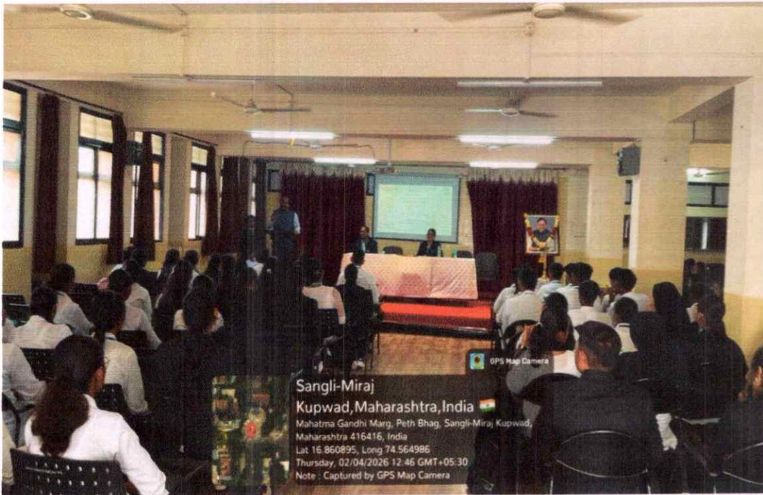
Sangli-Miraj Kupwad, Maharashtra, India Mahatma Gandhi Marg, Peth Bhag, Sangli-Miraj Kupwad, Maharashtra 416416, India Lat 16.860895, Long 74.564986 Thursday, 02/04/2026 12:46 GMT+05:30 Note: Captured by GPS Map Camera